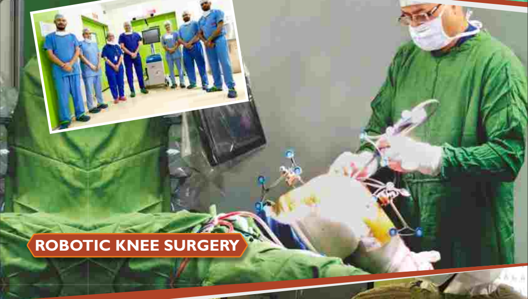
ROBOTIC KNEE SURGERY