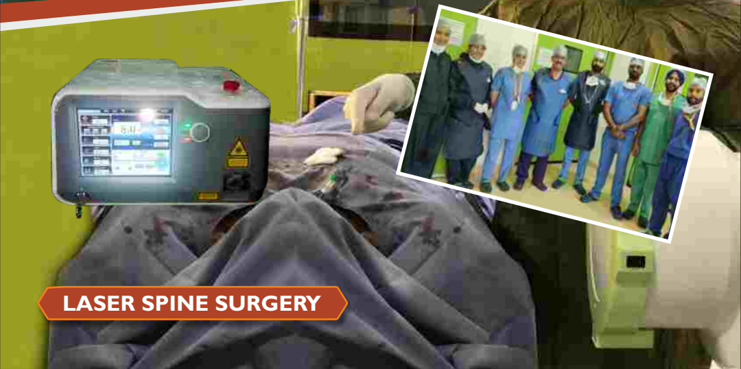
LASER SPINE SURGERY