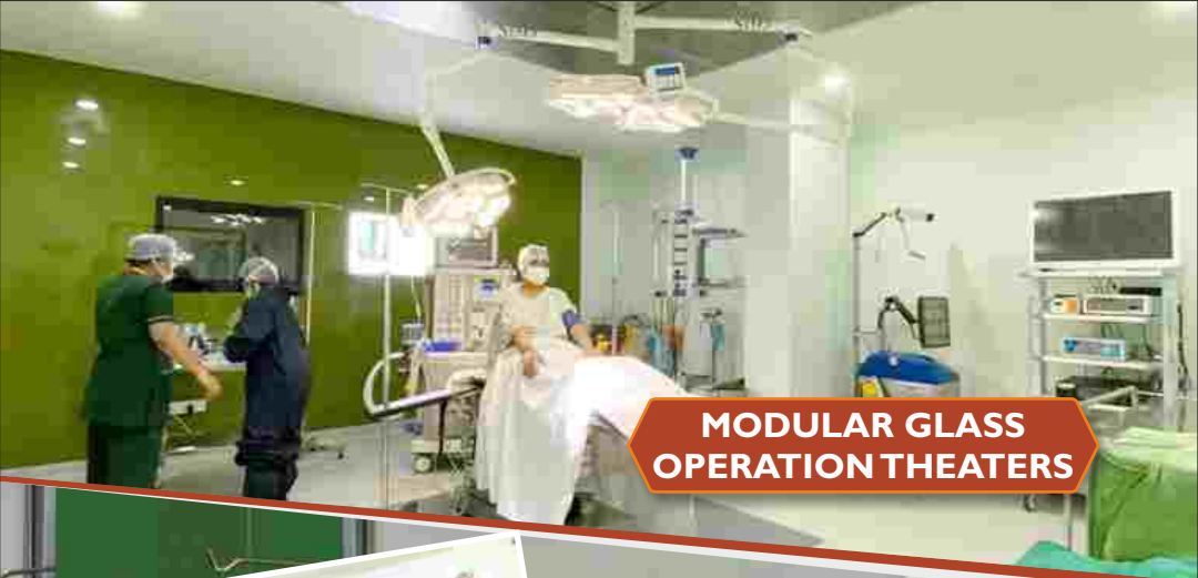
MODULAR GLASS OPERATION THEATERS